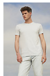
SOL'S MARTIN MEN 02855