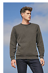
SOL'S SULLY 02990