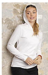
NEOBLU LOUIS WOMEN